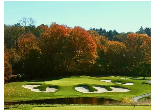
The Patterson Club Fairfield, CT