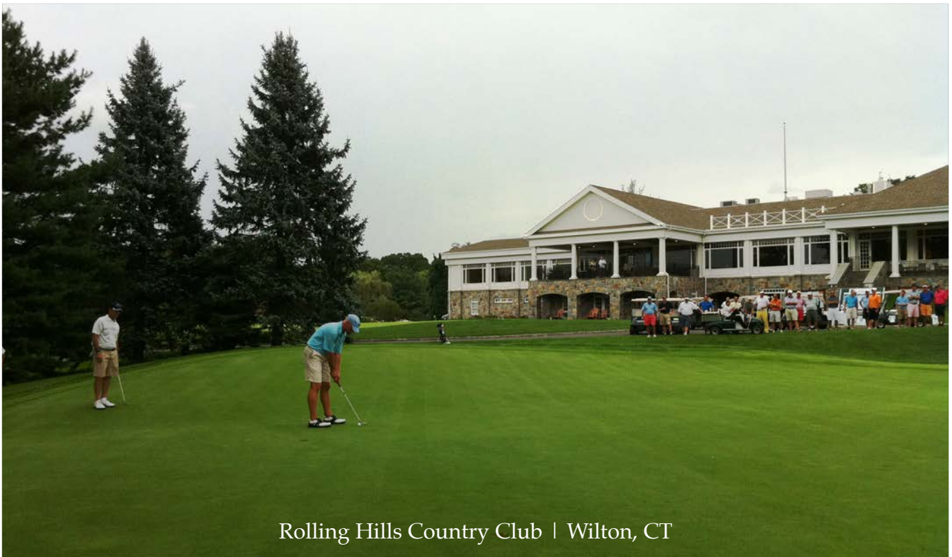
Rolling Hills Country Club | Wilton, CT